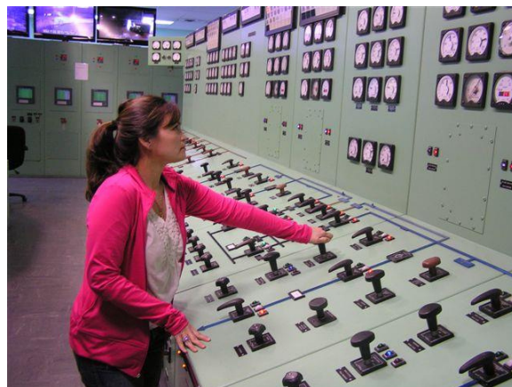
IBEW members like this employee of the Army Corps of Engineers will benefit from pro-worker nominees on the Federal Labor Relations Authority.

Click here for more on this article at the IBEW Media Center.